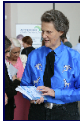
Dr. Temple Grandin